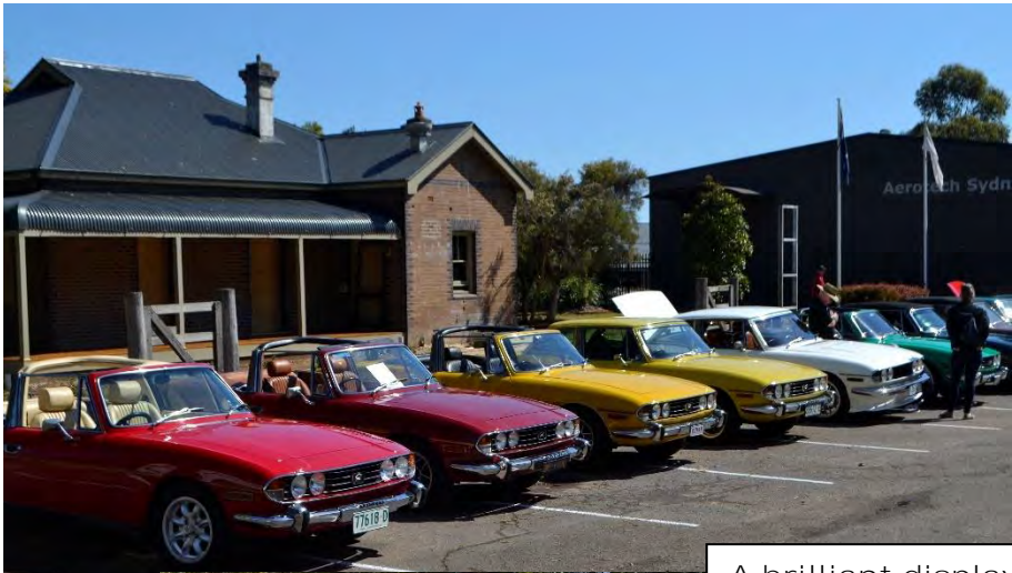
A brilliant display of TSOA NSW's finest , as many as 54 cars on the day.