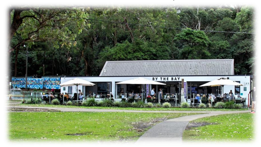
Plenty of easy parking, a good menu and dogs are welcome.