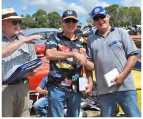
lan 2nd in Competition Class