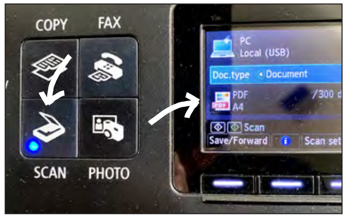
Here is how to create a PDF when scanning from your printer

If you have a printer that can scan and you, for example, have filled in your CPS application form (Club Plate) then you'll place the document onto the scanner and scan.