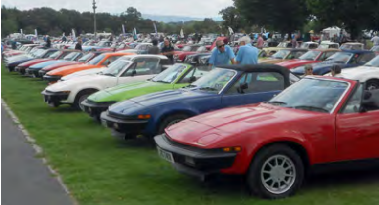
For 2023, the event is scheduled to be held at Silverstone over the weekend of 10/11th June, again in conjunction with the MG Car Club to celebrate the 100th anniversary of both marques.