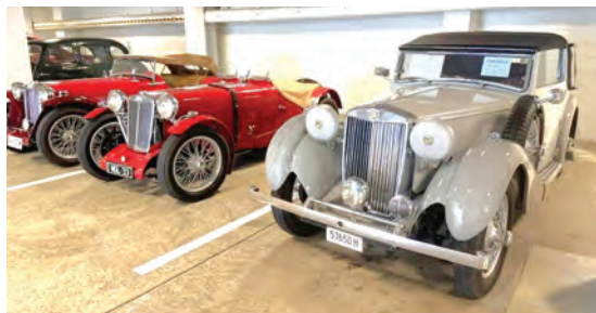
Pre War MGs in the Museum's carpark and below, at the Belvedere Hotel