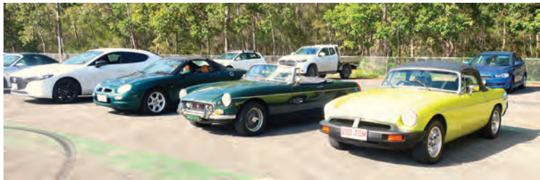
Gary S is pleased with the powder coating