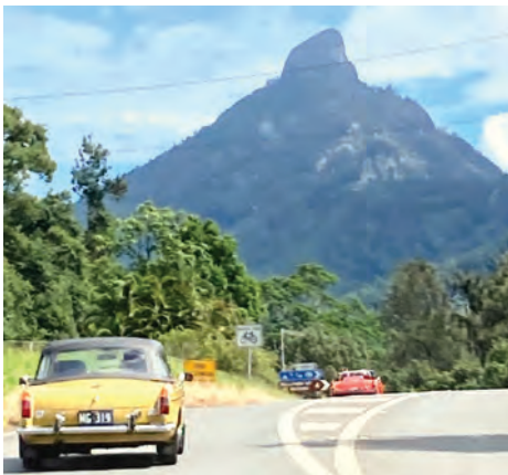
Mt Warning, NSW