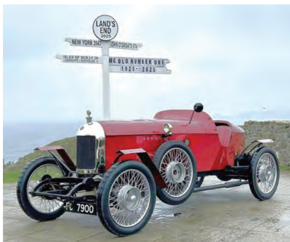
MG Car Club UK