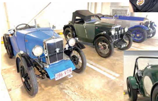
The Brisbane Motor Museum's display and meeting