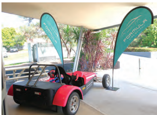
The race car built by the girls

Girls on track is part of a bigger program that is called Formula High School.