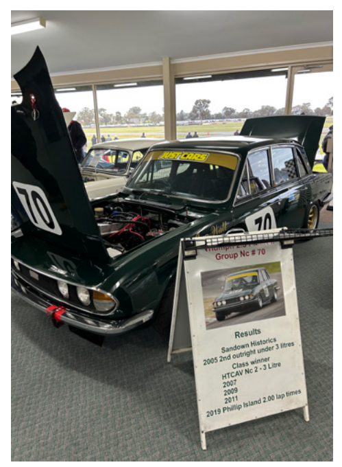
TSOA racing saloon