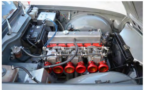
Above – TR6 fitted with a 2.6 L engine and three double Weber