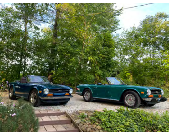
1973 TR 6 and 1974 TR 6

The Triumph TR6 (1968–76) is a sports car built by British Triumph Motor Company between 1969 and 1976. The TR6 was introduced in January 1969 and was produced through July 1976. The first series have commission numbers commencing with CP or CC. CP designating petrol injection and CC designating carburettors for the US market. The first bodies were built at Liverpool, in September 1968 and by December 1968 1,468 USA spec TR6s had been assembled at Canley, along with 51 export-market TR6PIs, home UK market assembly did not begin until the first few days of January 1969. The PI model has a brake horse power of 150, whereas for the US model, it is 104 bhp. The TR6 was the best-seller of the TR range when production ended, a record subsequently surpassed by the TR7. Of the 91,850 TR6s produced, 83,480 were exported; only 8,370 were sold in the UK.