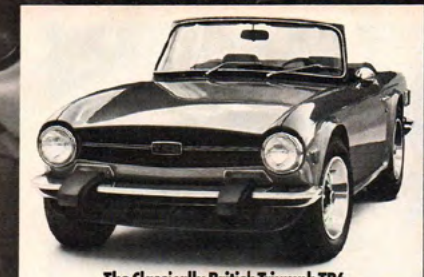
The Classically British Triumph TR6.

OPTIONS INCLUDE: electric overdrive in 3rd & 4th gears air conditioning and removable hard top.