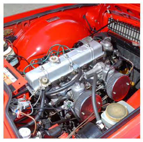
The 2.5-l inline 6 engine of a carbureted TR6

All TR6s were powered by Triumph's 2.5-litre straight-6, with the same Lucas mechanical fuel-injection as the TR5 for the United Kingdom and global markets, and carburetted for the United States, as had been the US-only TR250. The TR6PI (petrol-injection) system helped the home-market TR6 produce 150 bhp (110 kW) (152 hp DIN) at model introduction.