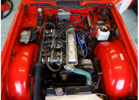
Above – 1974 Triumph TR 6 Rally Car