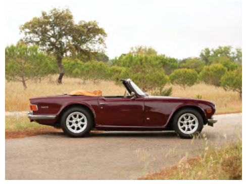
1969 Triumph TR6 PI

The TR6 featured a four-speed manual transmission. An optional electrically switched overdrive operated on second, third, and fourth gears on early models and third and fourth on later ones. Construction was traditional frame. Other features included semi-trailing arm independent rear suspension, rack and pinion steering, 15-inch (380 mm) wheels and Michelin asymmetric XAS tyres which dramatically improved the handling, pile carpet on floors and trunk/boot, bucket seats, and full instrumentation. Brakes were discs at the front and drums at the rear. A factory steel hardtop was optional, requiring two people to deploy. The dashboard was walnut veneer. Other factory options included a rear anti-roll bar and a limited-slip differential.