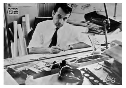
So, what can we say about this prodigious Italian car designer?

Every Triumph model from 1959 onwards, including Saloon, Estate, Dolomite, Stag, Herald, Vitesse, Spitfire, GT6 and all TRs (except the TR6, TR7 and Acclaim), owes its good looks to one man. Enter Giovanni Michelotti.