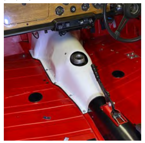
The clutch and brakes proved impossible to bleed, a not uncommon

The gearbox tunnel had been previously covered in some sort of rubber, presumably to reduce noise. It was all removed, the fibreglass sanded back and painted in ultra high-gloss white paint. It looks better than new but, of course, it won't be seen as it is under carpet. At least I know it is done properly.