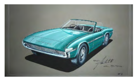
Another design he submitted to Triumph was the TR4 IRS. A prototype was never built, but a signed drawing exists.