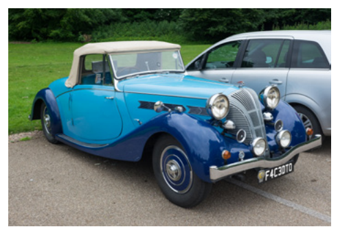
2-litre Foursome drophead coupé

testers appear to have been impressed by everything except the ambient weather.