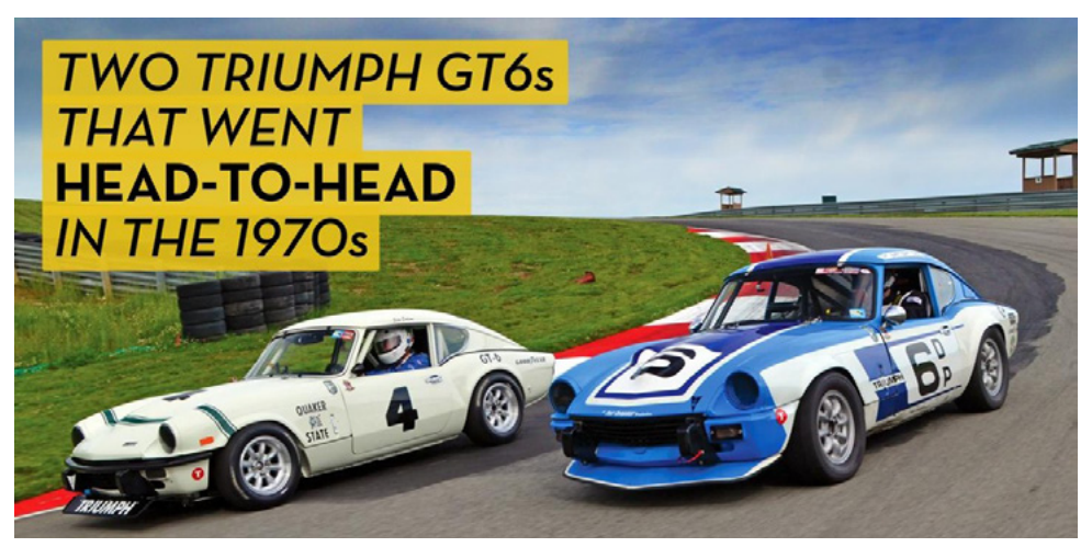
From Classic Motorsports, 6 June 2018 and December 2023