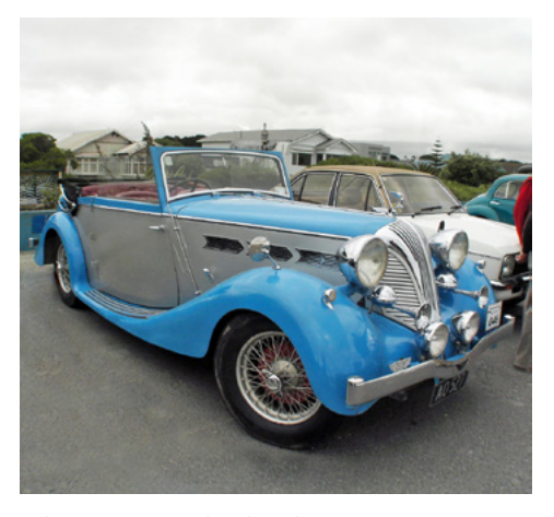
2-litre Foursome drophead coupé

The cars received excellent reviews from the period motoring press.