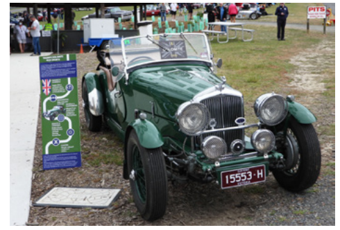
1939 Dolomite / John Lakeland

In addition to our display cars, we had quite a roll up of Triumph classics to join the car display in the car park. In fact, the car park had an amazing variety of classics from old Alfas and a Renault Alpine, to Rolls Royces and AC Bristols. It was well worth spending time just strolling through to check them out.